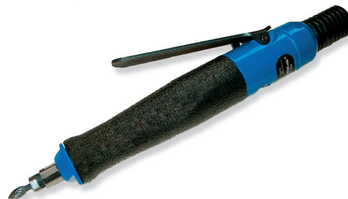
GDS 013-720 BX