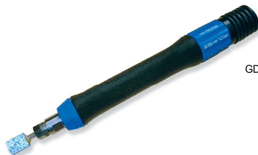
GDS 011-550 BY

Small grinders with collets are especially well suited for the precision grinding with grinding tips and for fabricating using carbide cutters in foundries, in the tool-, die-, and mold making or in small industrial areas.